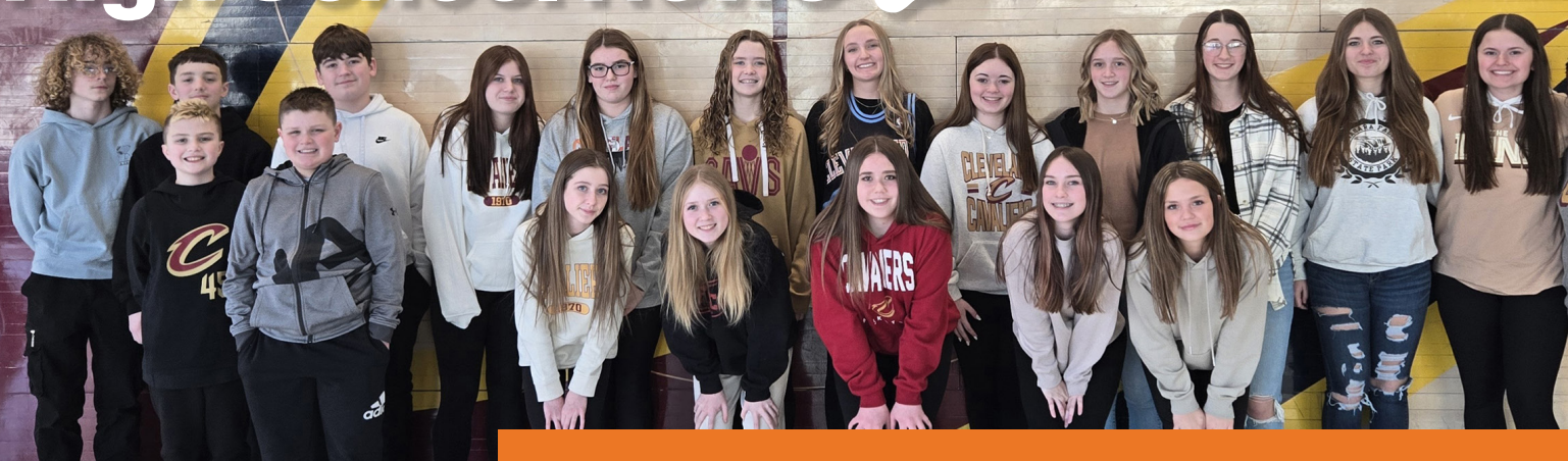
The FCCLA attended Cavs Day to learn about careers at Rocket Mortgage Field House!