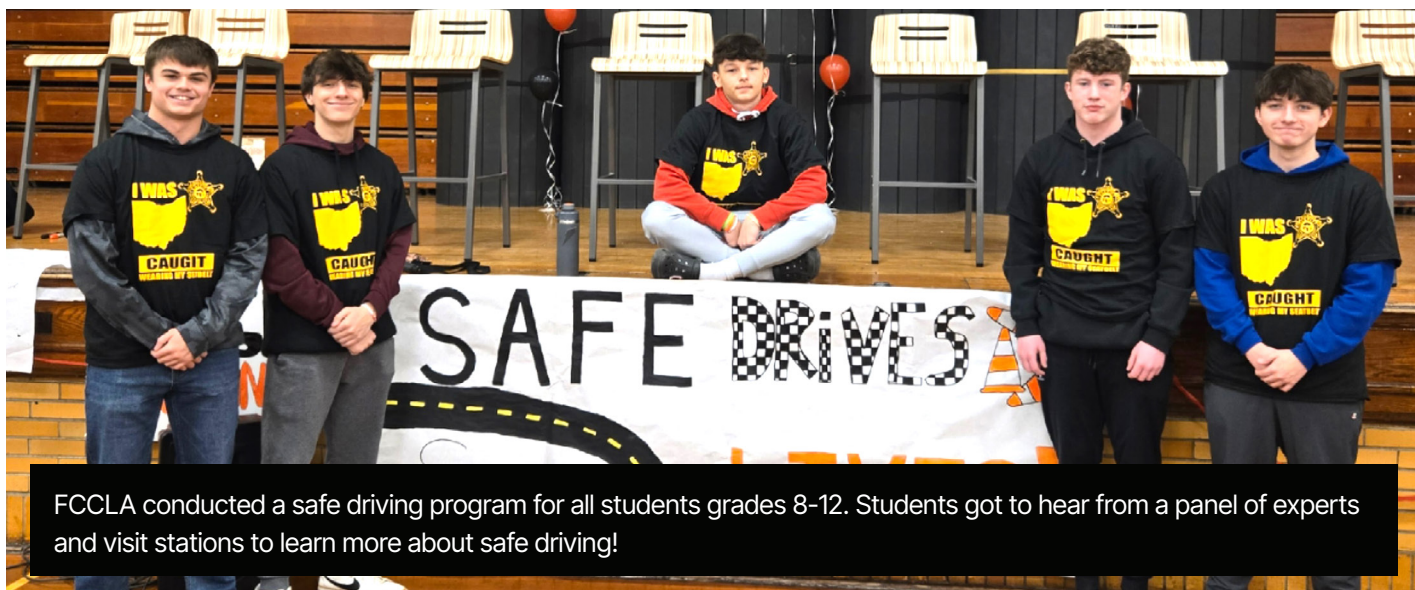
FCCLA conducted a safe driving program for all students grades 8-12. Students got to hear from a panel of experts and visit stations to learn more about safe driving!